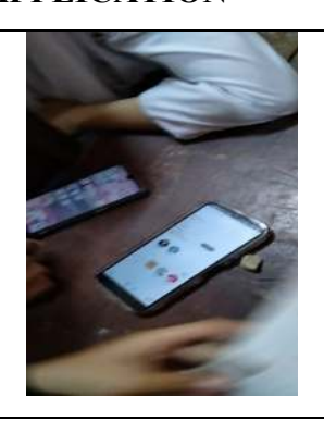
SMK NEGERI 1 PRABUMULIH