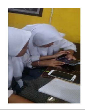
TEACHING AND LEARNING HILOKAL APPLICATION