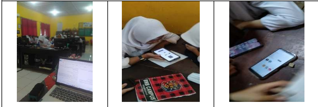
SMK NEGERI 1 PRABUMULIH