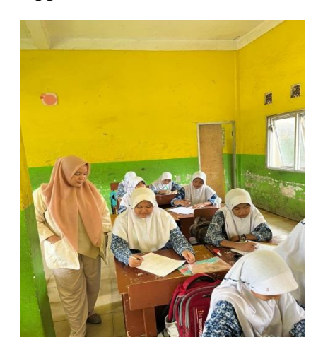
Appendices 4. Documentation of research implementation